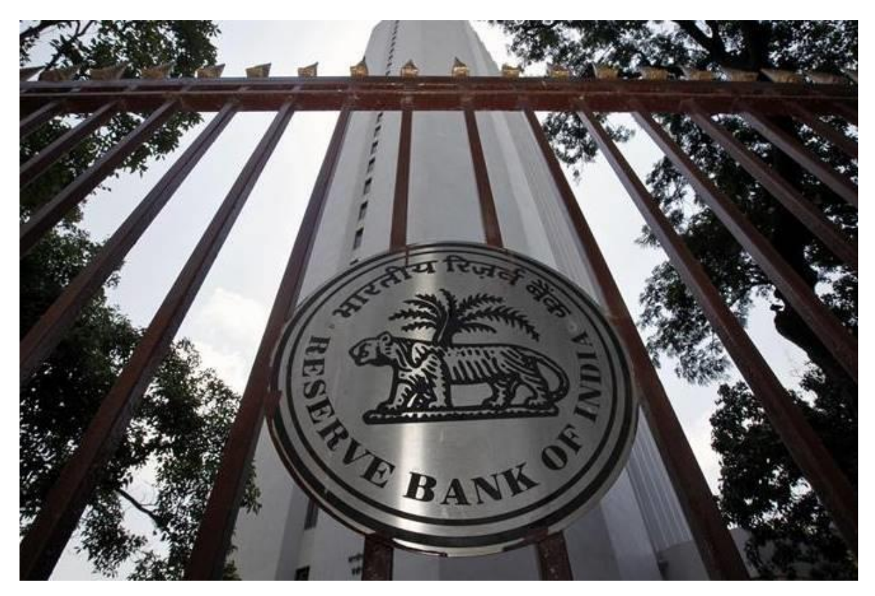
After the electoral success for the BJP post-demonetisation, it was argued by some that demonetisation had the acceptance of the citizens as an effort to cleanse the system, while others argued it was marketed with right packaging. (Reuters)

The banking volume—deposits that have grown and credit that has shrunk was too insignificant to have had an impact on the economic life of citizens in most parts of India