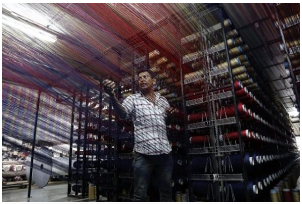
Indian worker checking thread reels on a carpet weaving machine at a factory on the outskirts of Jammu.